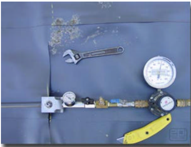
Figure 1. PVC Air channel burst testing

In order to provide the basic information, dual track hot air welding was used on 54 different PVC seam variations. In order to establish the variable parameters, three different welding temperatures with three different welding speeds were selected. These were performed on materials at three different ambient temperatures. These 27 different combinations were used to weld 30 mil and 40 mil PVC geomembrane. To further broaden the data base, the same variations were duplicated using hot wedge welding on 30 and 40 mil PVC, bring the total to 108 sample variations.