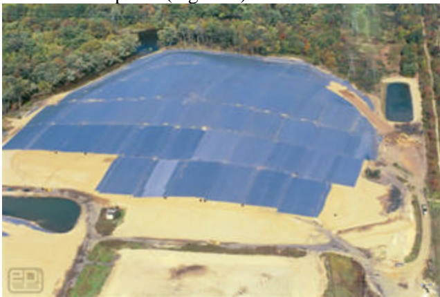
Figure 4. Aerial view of Type III cell PVC cap.

The project consisted of two cells. The Type II cell was an ash fill requiring 55,000 M 2 of 30 mil PVC liner. The liner was placed directly on the fine, black ash material compacted on the 3/1 slopes of the cell. The second area was a Type III waste cell that had been covered with two feet of sand material by Terra Contracting, LLC, the prime contractor on the project. This cell required 130,000 M 2 of PVC. The PVC liner would also be placed directly on the sand layer already placed over the Type III waste on slopes varying from 5/1 up to 3/1 shown in the photo (Figure 4).