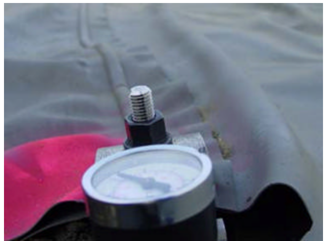
Figure 5. Inflated PVC air channel test

All field seams were also to be non-destructively air channel tested (Fig. 5) according to established levels for air pressure and sheet temperature. Based on research previously completed by EPI and the PGI, the installer was able to verify that peel strength exceeded the minimum requirement of 15 lb/in (2.6 kN/m) width for the full length of EVERY field seam.